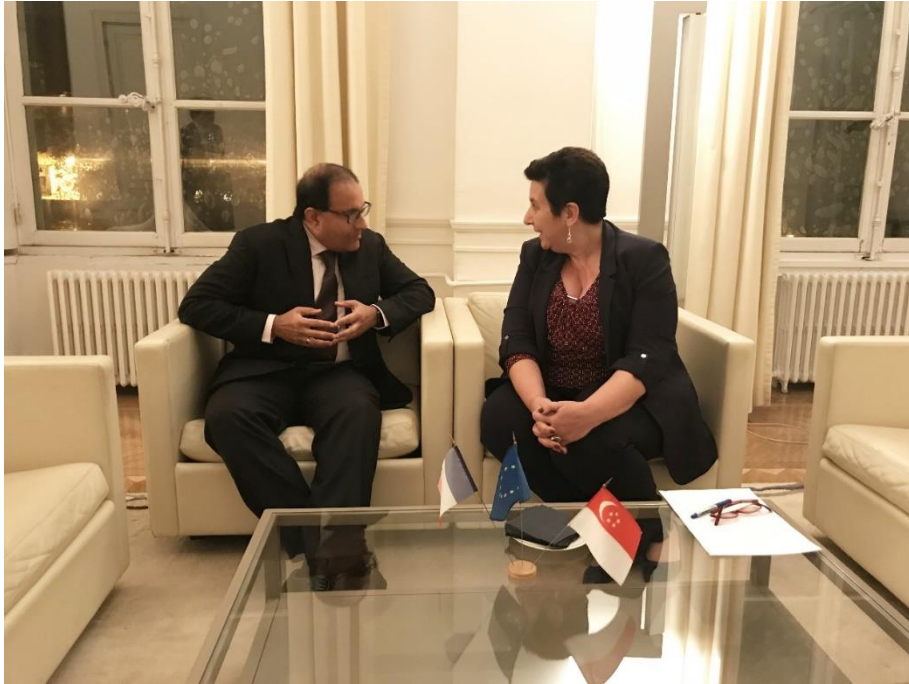
Caption: Minister Iswaran and Minister for Higher Education, Research and Innovation Frédérique Vidal