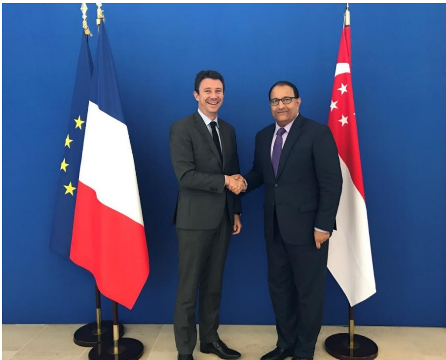
Caption: Minister Iswaran and Secretary of State for Economy and Finance Benjamin Griveaux