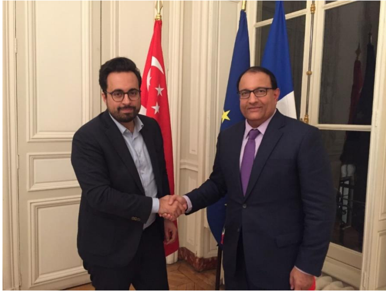
Caption: Minister Iswaran and Secretary of State for Digital Industry Mounir Mahjoubi