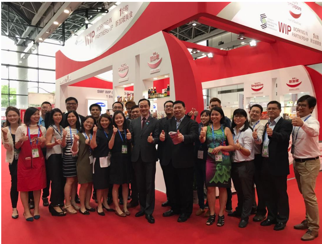
Senior Minister of State Dr Koh Poh Koon visiting Singapore's Commercial Pavilion.