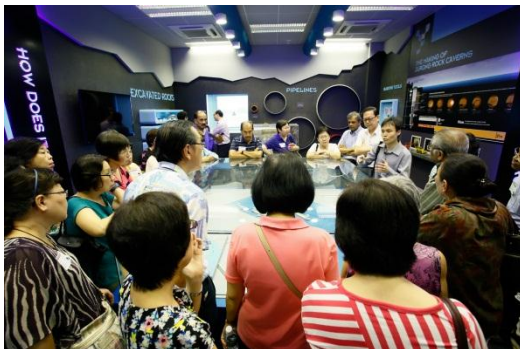
Pioneers gathered at the Jurong Rock Caverns Gallery for a tour explanation.

The day started bright and early at the JTC Summit with our pioneers visibly excited; and they had every reason to be so. Gazetted as a Protected Area since October 2001, Jurong Island has been off-limits to visitors, and this was an once-in-a-lifetime trip. The hour-long ride brought our pioneers through Jurong Island's key developments, including refineries, crackers and the Jurong Rock Caverns Gallery.