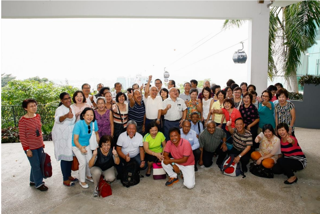
Our pioneers cheering for the camera at the Faber Peak.

Spirits were high as 55 of our pioneers within the MTI family gathered on 5 November for a bus tour of Singapore's key developments – Jurong Island and Sentosa. Specially organised by JTC ahead of the Tribute Dinner, the excursion lent an excellent chance for our pioneers to interact with one another, as well as to witness the fruition of their hard work and contribution to the economic development of Singapore.