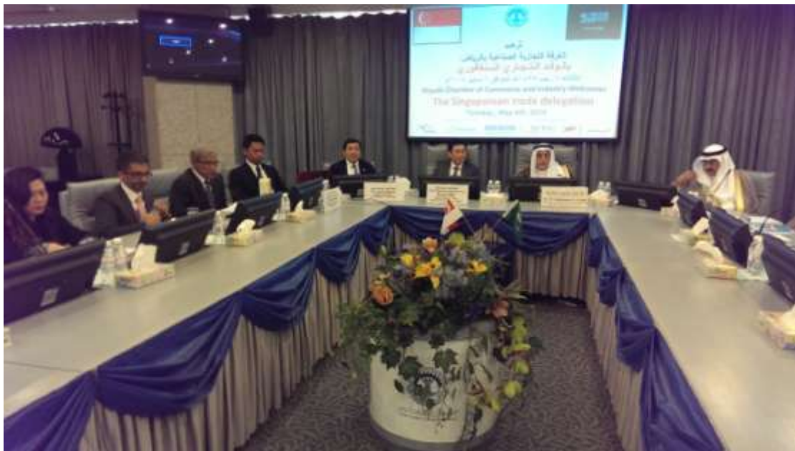
Caption: The outreach seminar in Riyadh highlighted economic opportunities arising from the GSFTA.